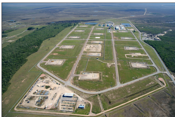
U.S. Strategic Oil Reserve

New tests recently performed by DM Petroleum Operations Company with the FPI Mag® Flow Meter from McCrometer continue to confirm the flow meter's accurate performance and reliability on two rugged Texas brine disposal lines supporting the U.S. Strategic Petroleum Reserve (SPR). The first FPI Mag Flow Meters were originally selected for conducting periodic tests on the brine lines in 1996, and the latest generation of FPI Mag meter validates the dependable performance first experienced over 17 years ago.