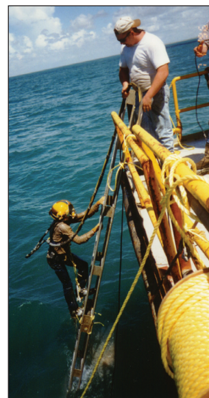
Divers Testing Brine Lines

DM Petroleum Operations Company, Inc., formerly known as DynMcDermott, manages and operates the SPR under contract to the U.S. Department of Energy (DOE). DM has been the SPR management and operating (M&O) contractor since 1993. The company manages four storage sites: two in Louisiana and two in Texas.