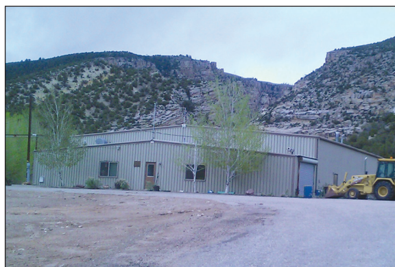
Figure 1: Ashley Valley Water & Sewer Improvement District (AVWSID)

Goodrich said, "The FPI Mag meter is performing very well in normal operations, including high flow cycles, such as when we flush the plant's filters. The immediate benefit of the FPI meter is its accuracy and reliability over the full range of flow rates required by our plant's operations."