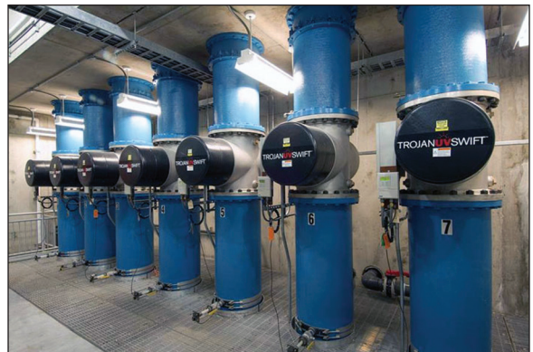
Figure 3: FPI Mag Flow Meters Installed In UV Processing

Goodrich noted there was a burst pipe incident at the plant, which soaked the instruments and automation equipment. The staff had to turn off the power to fix the problem. When the power was turned back on, the FPI Mag meter and its transmitter came right back online without the need to reset parameters or make additional adjustments.