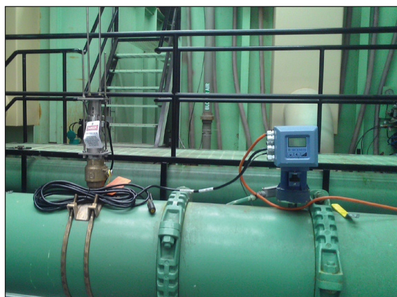
Figure 2: The FPI Mag Flow Meter Installed In The Water Treatment Plant